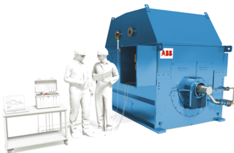
ABB Ability™ LEAP (Life Expectancy Analysis Program) is an advanced solution for analyzing the condition and expected lifetime of the stator winding insulation – the most uptime critical component in high voltage motors and generators.